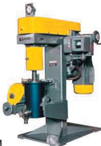
1-SDM 05-SDM (not pictured)