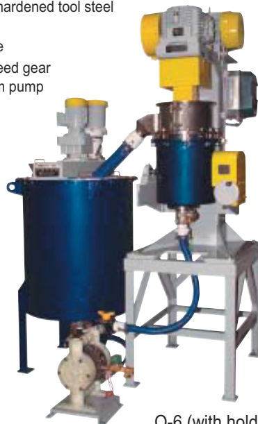
Q-6 (with holding tank)